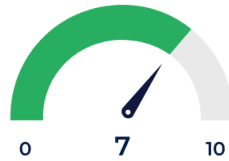
Global Needs Intensity Score